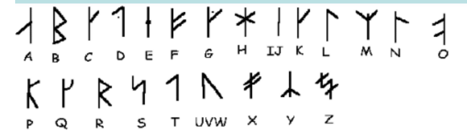
The Viking Runic Alphabet

Here is the 24 character Viking runic alphabet arranged following our alphabetical order. Can you see any letters That are similar to ours?